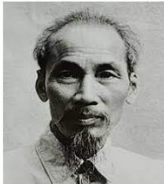
Figure 1- President Ho Chi Minh

the press is to serve the people, to serve the revolution. That is (source: Ho Chi Minh Complete Volume, Volume 10. National the task of the entire Party and people, as well as the task of Politics Publishing House, H.2005, p.613). our press”.