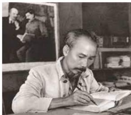
Figure 2 - Ho Chi Minh and publishing