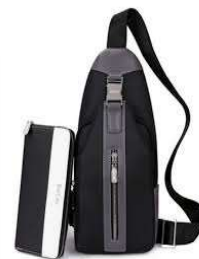
Fig. 2 Example of an unacceptable low-resolution image

Figures must be numbered using Arabic numerals. Figure captions must be in 8 pt Regular font. Captions of a single line (e.g. Fig. 2) must be centered whereas multi-line captions must be justified (e.g. Fig. 1). Captions with figure numbers must be placed after their associated figures, as shown in Fig. 1.